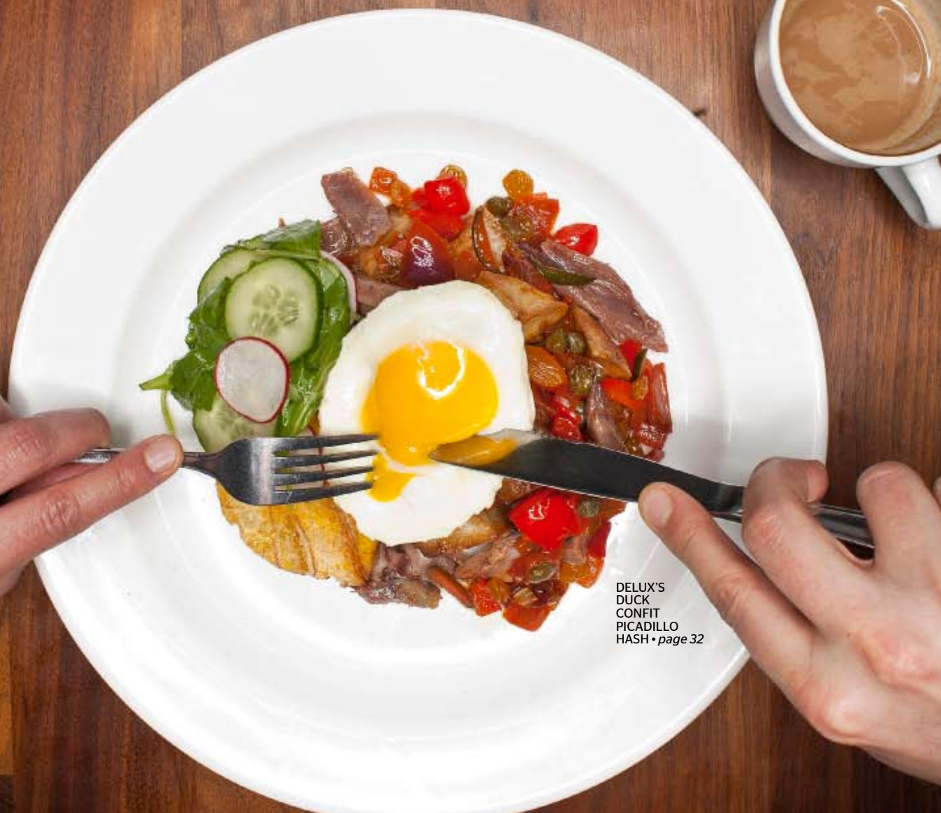
DELUX'S DUCK CONFIT PICADILLO HASH • page 32